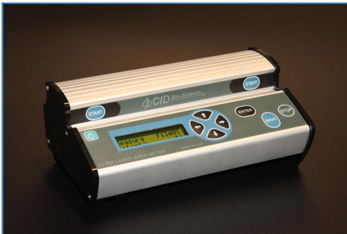
Figure 1. CI-202 Portable Leaf Area Meter

Congratulations on the purchase of your new CI-202 Portable Leaf Area Meter. Making leaf measurements in the field or laboratory is now very easy with the CI-202 Portable Leaf Area Meter. This state-of-the-art instrument has been designed to be the most portable leaf area measurement system available. Although you are anxious to use your new meter, please take the time to read this manual first. For more information about the CI-202, such as recent peer-reviewed publications using the CI-202 or the technical support forum, please visit the CI-202 Product webpage at http://www.cid-inc.com/leaf-area/ci-202.php .