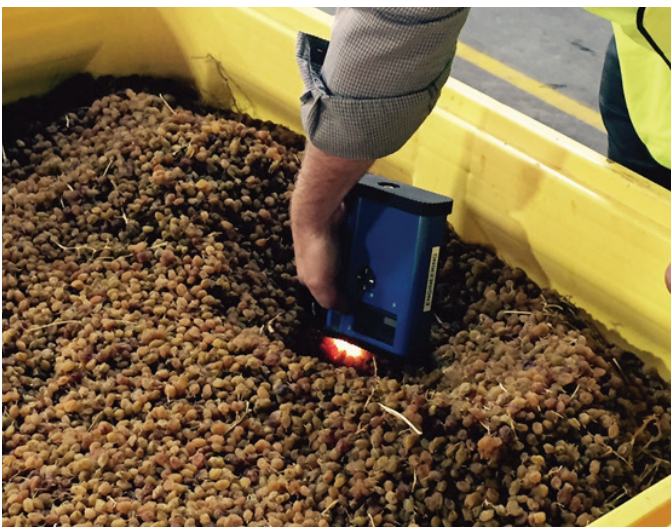
■ Figure 1. Fruit presentation for measuring sultanas in a bin with the F-750.

A strong correlation existed between spectral data and collected reference values, with a model prediction R 2 of 0.92 for moisture content of sultanas. Figure 2 displays this correlation and demonstrates the consistency of measurement with an independent dataset.